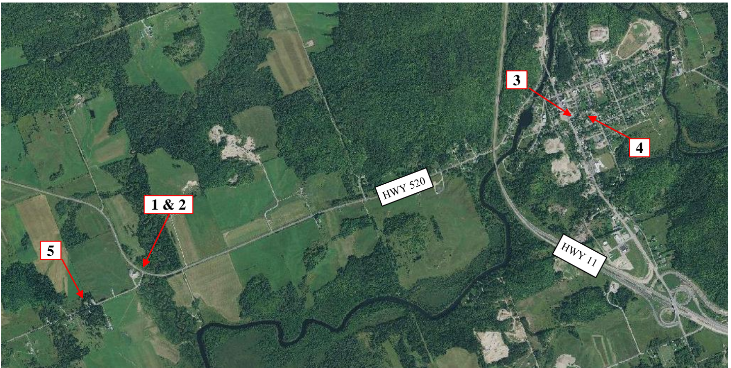
Figure 2. Locations of Ryerson-managed operations as detailed in Table 1