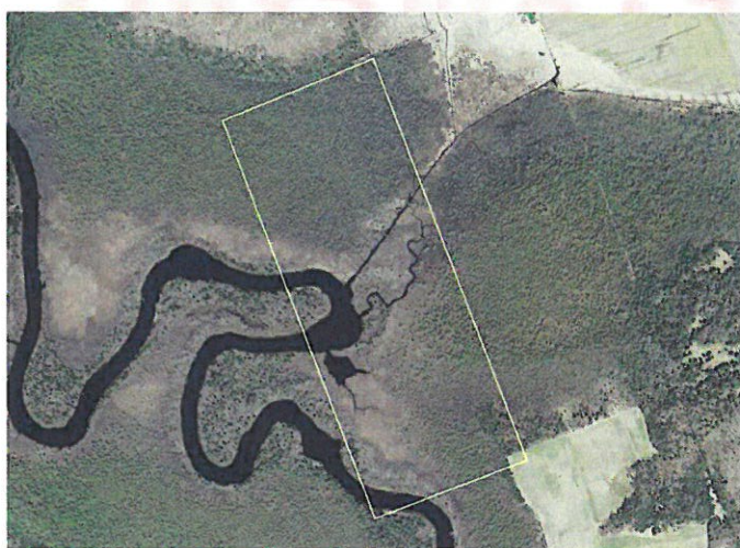
Photo Date: 2016. NOT A PLAN OF SURVEY. Boundary may not line up with aerial photo.