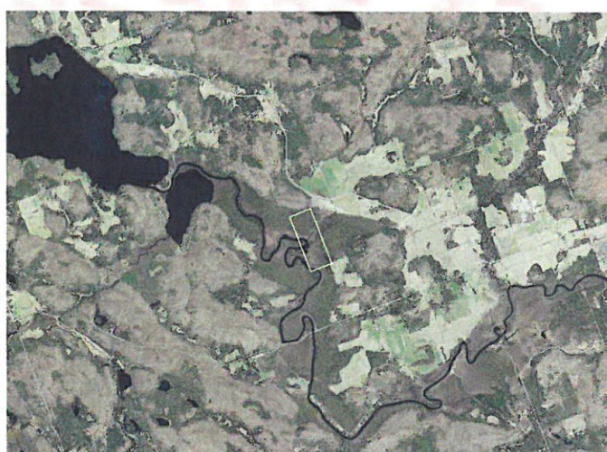
Photo Date: 2016. NOT A PLAN OF SURVEY. Boundary may not line up with aerial photo.

Maps and photos are provided as a courtesy only and the municipality makes no warranties as to the accuracy of this information. Boundaries on aerial photos may be skewed.